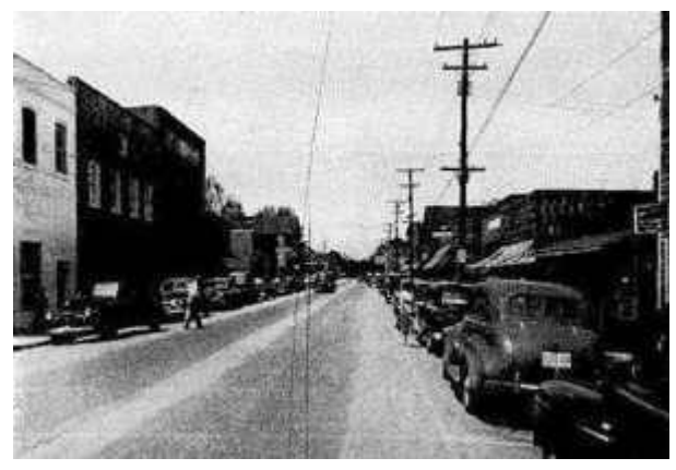
Main Street looking west

A visitor wrote about Monck's Corner in July, 1890: "The place is an incorporated town according to the acts of the Legislature but several stores, bar rooms and dwellings constitute its only claim to township." This was true, especially as to population, but what this reporter failed to tell his readers was that the place had long been an important business center. The several stores enjoyed a patronage which assured a satisfactory annual profit. A long loading platform on the north end of the large railroad warehouse was built to